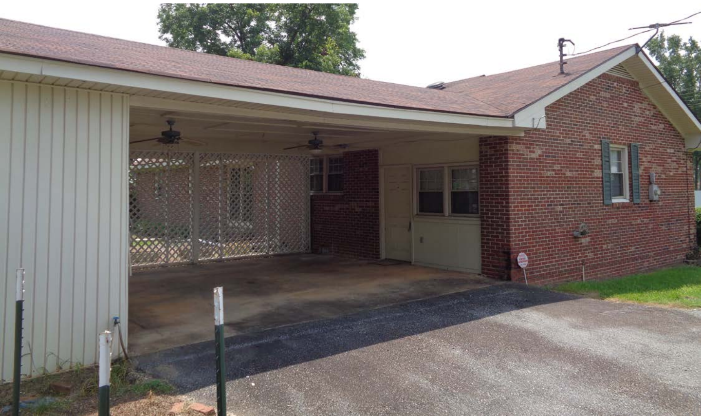
View of Carport and Utility Room