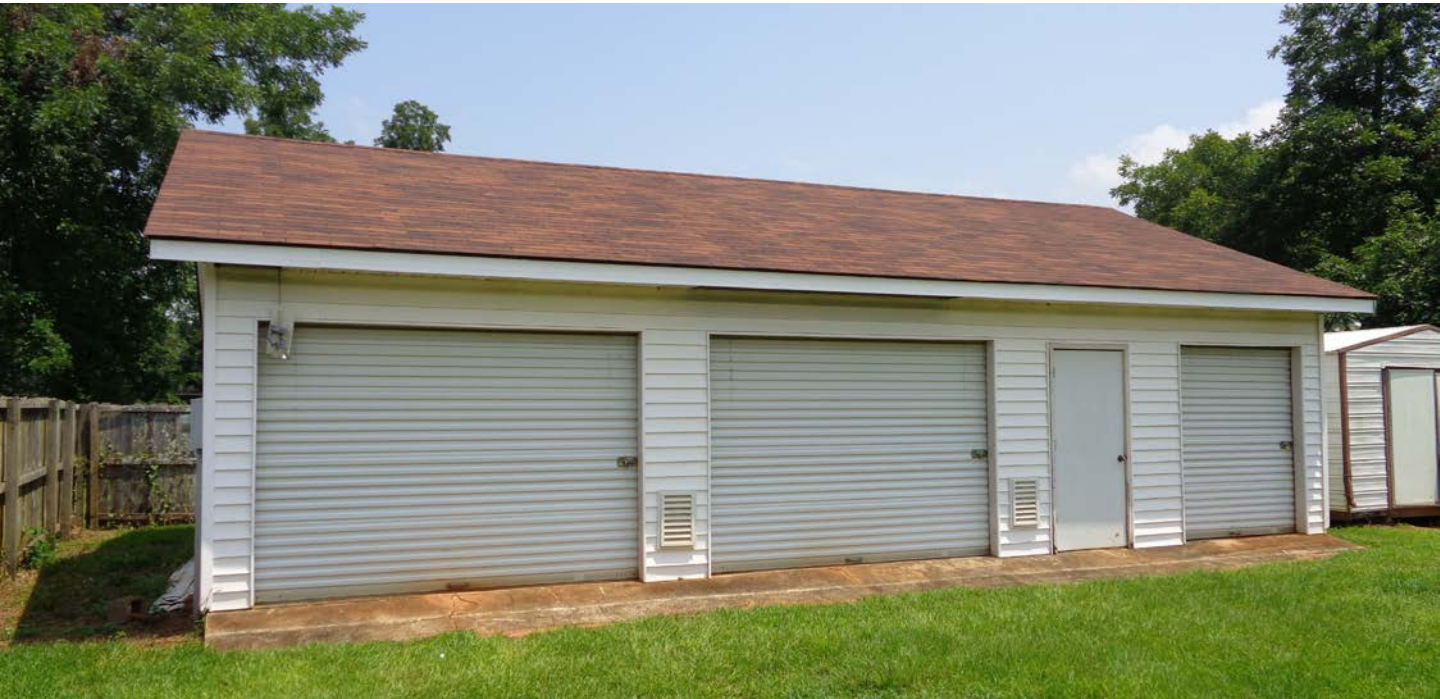
Detached 3-Bay Storage Building