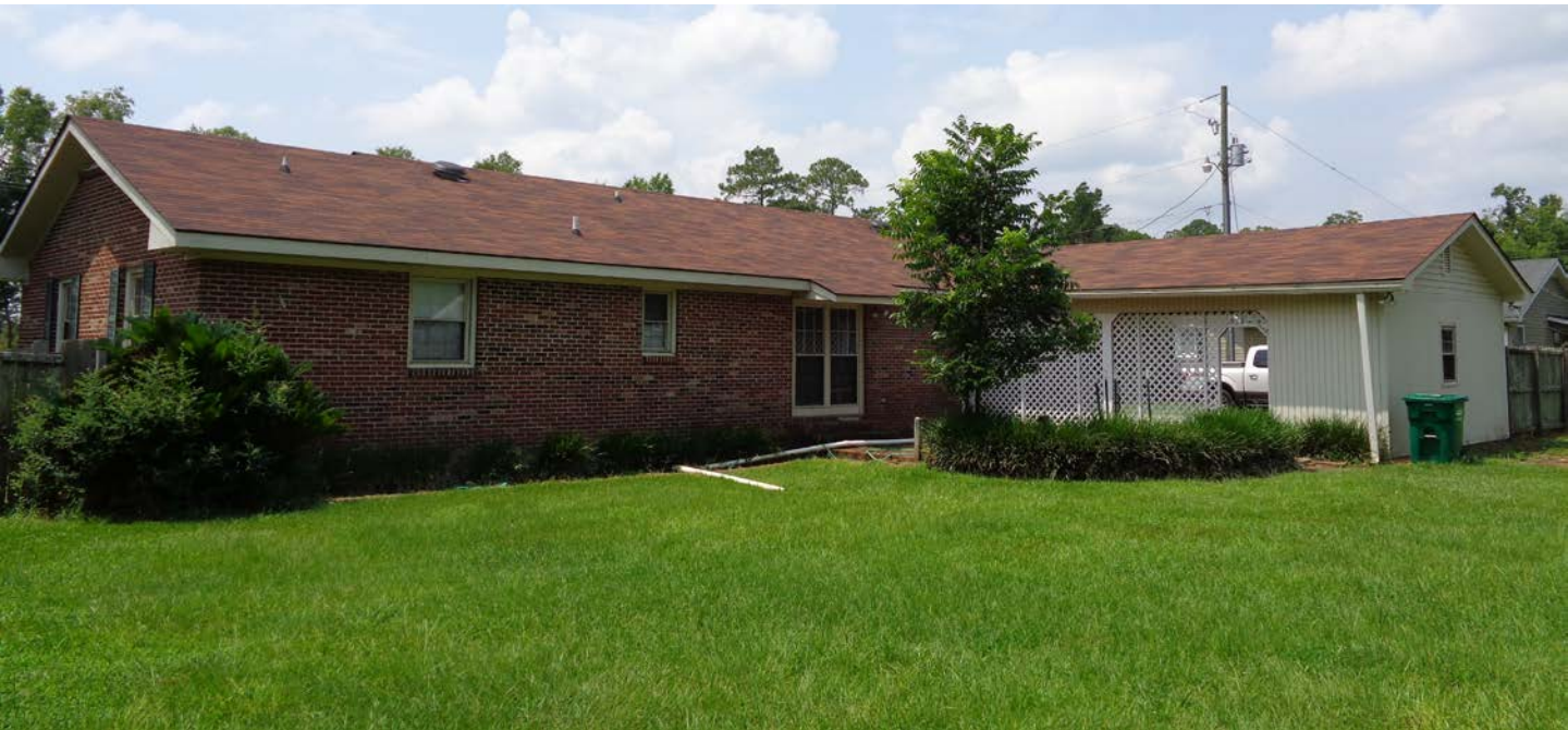
Rear View of Main Building