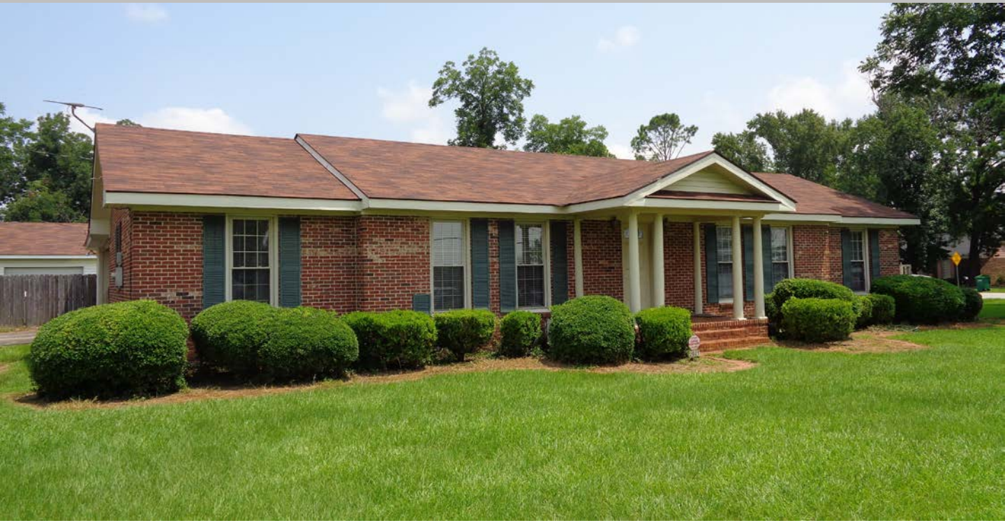
Front View of Main Building